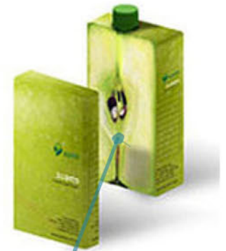
GRAPHIC ON LID