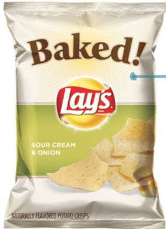
TEXTURE OF LID