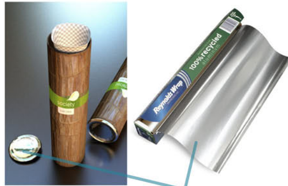
CONTENT UNDER LID