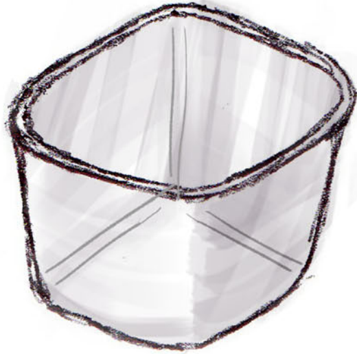
CLEAR PLASTIC CONTAINER