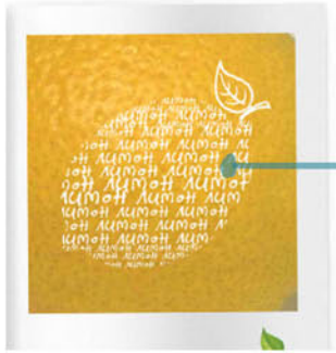
POSSIBLE GRAPHIC ON CONTAINER