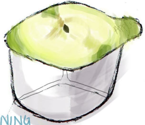
LID CONTAINING FRUIT GRAPHIC