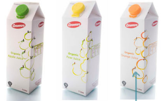
POSSIBLE GRAPHIC ON CONTAINER