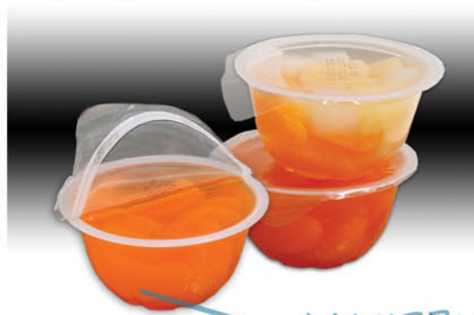
MATERIAL OF CONTAINER