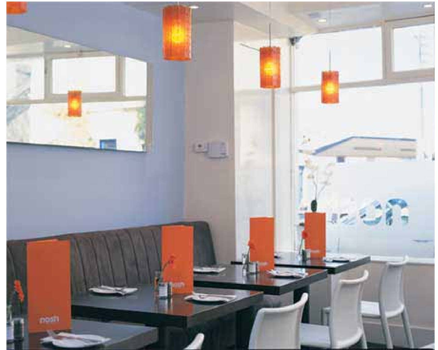
Interior Overall Look