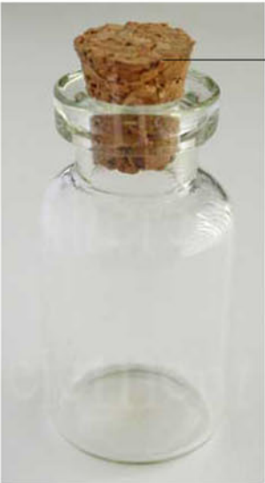
The idea of a cork branched into this from the smokestack.