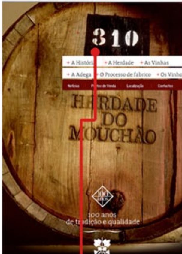
Irregular shapes to create interest