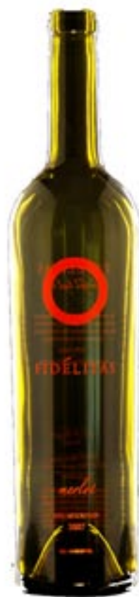
Embossing text and design onto the bottle