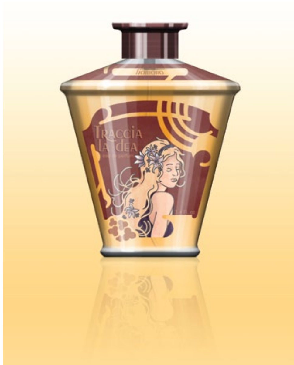
At actual size: 4" x 3"